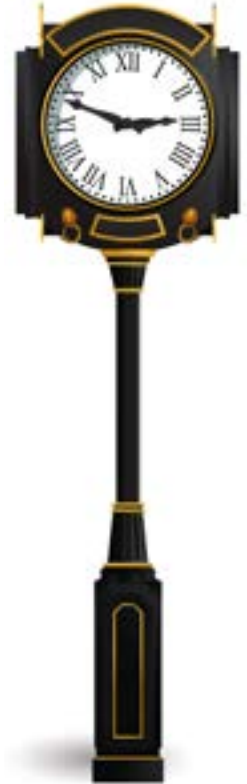
Quad Classic Available in 16'