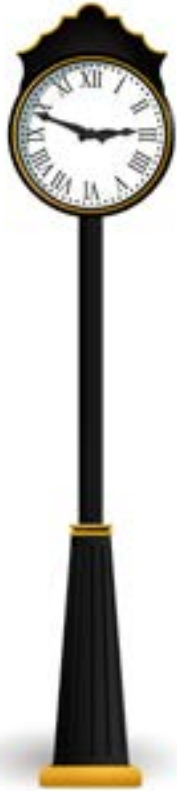
Elegance Available in 10'