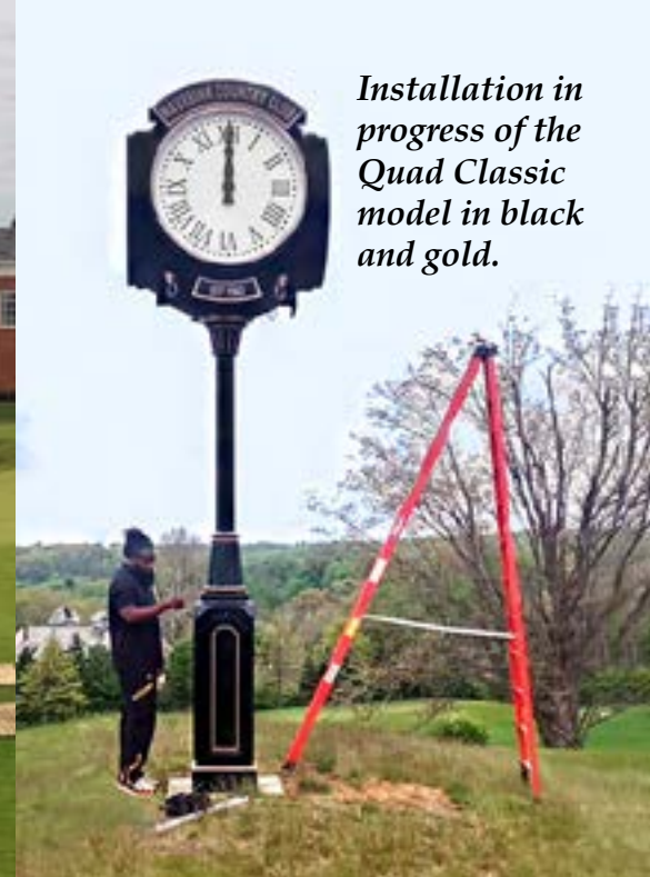
Installation in progress of the Quad Classic model in black and gold.