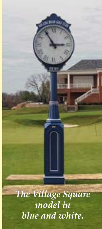
The Village Square model in blue and white.

NCS Neill Carillon Service 973-703-4695 ken@kenthebellman.com www.kenthebellman.com PO Box 189 • Highland Lakes, NJ 07422