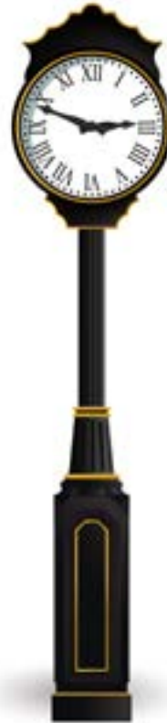
Twin Classic Available in 11', 13' 6" and 16'