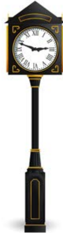
The Village Square Available in 12' and 16'